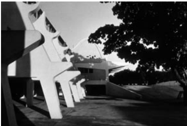
10 "Saipal Bakery", 1952, in Lourenço Marques