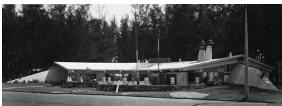
22 "Zambi Restaurant", 1958, in Lourenço Marques