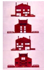
18 "Red House", 1969, © Pancho Guedes