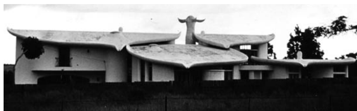
23 "Swazi Zimbabwe House", 1960 -65, in Goedgedun