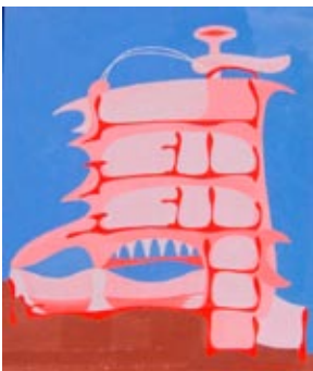
16 "Núcleo de Arte", 1954, © Pancho Guedes