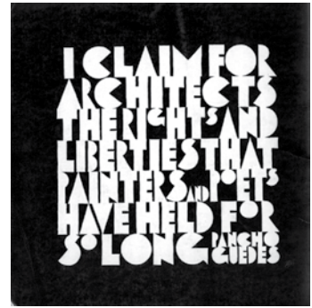
3 "Manifesto painting", © Pancho Guedes