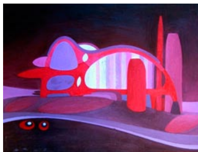
20 "Saipal Nocturno", 1977, © Pancho Guedes