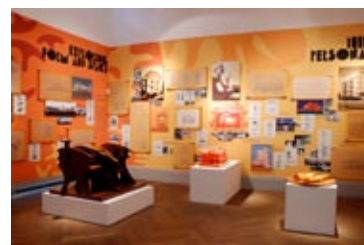
26 Ansichten aus der Ausstellung / Exhibition views, © Christian Hiller