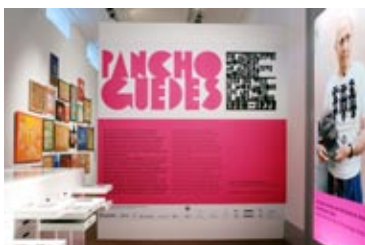
24 Ansichten aus der Ausstellung / Exhibition views, © Christian Hiller