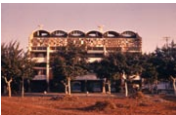
7 "Smiling Lion", 1956, in Lourenço Marques