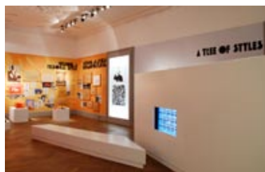
25 Ansichten aus der Ausstellung / Exhibition views