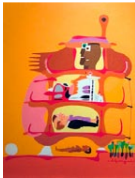
14 "Smiling Lion Inhabited Section", 2007 © Pancho Guedes