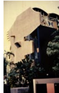
6 "Smiling Lion", 1956, in Lourenço Marques