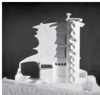
8 "Núcleo de Arte" (Modell), 1954