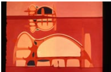
19 "Saipal section dreams its facades", 1981, © Pancho Guedes