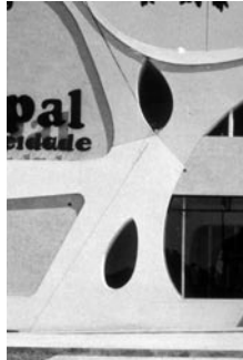
11 "Saipal Bakery" (Detail), 1952, in Lourenço Marques