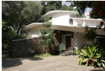
5 "Leite Martins House", oder/ aka "Airplane House", 1951, in Lourenço Marques