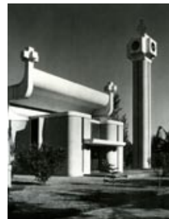
21 "Sagrada Família de Machava", 1964, in Machava