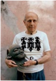
1 "Pancho Guedes", 2005