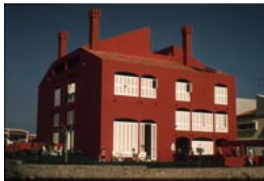
17 "Red House", 1969, © Pancho Guedes