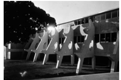
12 "Saipal Bakery" (Rückfassade/ back view), 1952, in Lourenço Marques